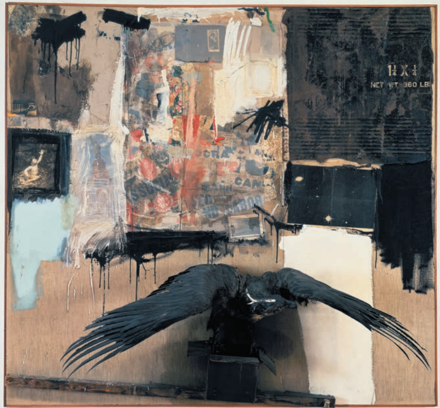
Robert Rauschenberg, Canyon , 1959

That's not how the IRS sees it. There have been cases when the black market value of restricted items, such as protected Native American antiquities, has been held